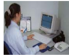
Computer, fax, phone, photocopier etc.

All these applications but just one card – yours